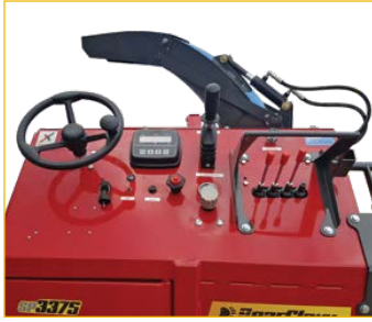
Intelligent console design for ease of speed and control.