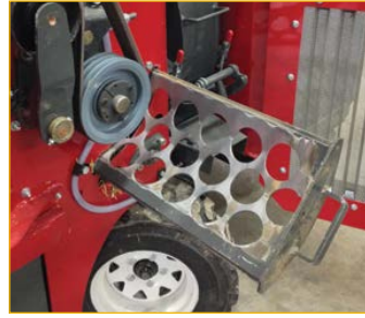
Removable screens allow you to fine tune your length of cut.