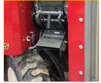
Bottom discharge chute for lower distribution.

Utilizing the top blower chute, the BearClaw can blow shredded straw up to 50 feet.