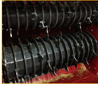
Steel hooks require no sharpening and shred bales quickly and efficiently.